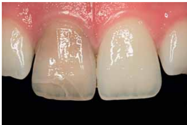
Fig. 1 Young patient after anterior tooth trauma and endodontic treatment of tooth 11 five years ago alio loco.

A sealed root-canal filling is an important requirement for allowing an endodontically treated tooth to be bleached. The tooth must be symptom-free, but a waiting period is called for in the case of a radiologically detectable periapical radiolucency. Such lesions should be observed to determine whether the alteration is increasing or if a healing process is apparent. In every case, the root-canal filling material should be sealed with a base material, in order to prevent penetration of the bleaching agent into the periodontal space or root canal (DE OLIVEIRA ET AL. 2003). The ubiquitous cements used to close perforations must also be covered with a base. Particularly MTA exhibits a much-reduced marginal seal when it comes into contact with bleaching agents (LOXLEY ET AL. 2003). Prior to