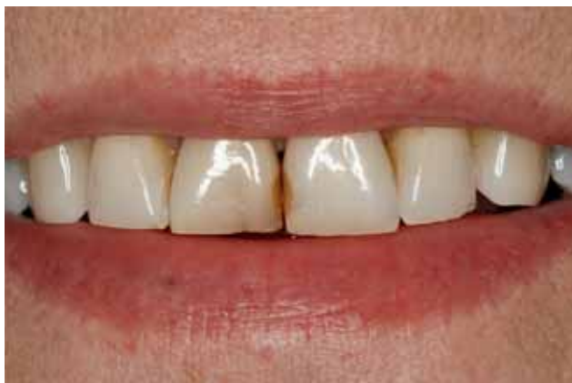
Fig. 8 Follow-up three months after bleaching. The patient did not want new composite restorations.