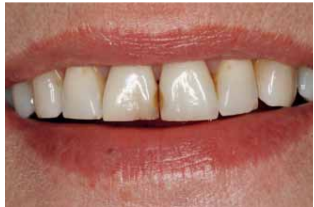
Fig. 4 Final documentation (same patient as in Fig. 3). Bleaching success is satisfactory, but the discolored approximal composite restorations on 11 and 21 are even more obvious.

teeth (BUSSADORI ET AL. 2006), the authors of the article reject this form of treatment due to lack of compliance and a high cost:benefit ratio. This treatment approach does not seem practical. The patient must be informed that by preparing a new access cavity, an increased risk of tooth fractures exists during treatment, and that the tooth to be bleached must not be loaded too heavily (BARATIERI ET AL. 1995).