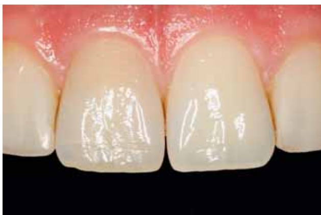
Fig. 7 Follow-up examination nine months after bleaching. During that period, the lateral incisors were widened using composite.