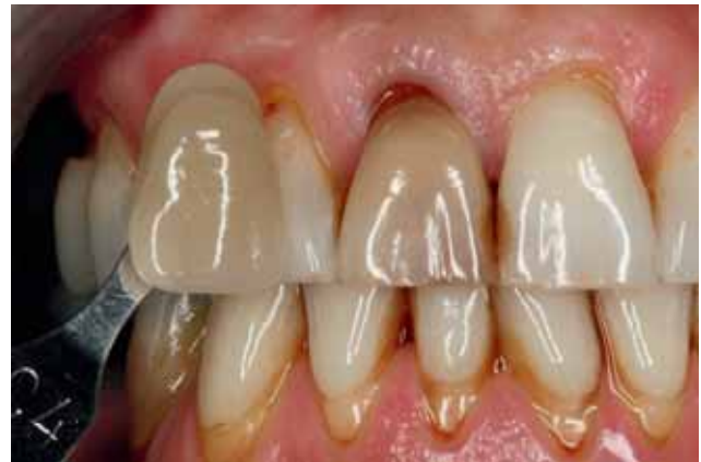
Fig. 3 Baseline situation with Vita color key. Tooth 11 shows greater discoloration than the shade sample Vita C4.

Prior to bleaching, each case should be photodocumented (Fig. 1), including a color key (Fig. 3), to objectify the result and make treatment success verifiable. The patient must be informed of the risks of the treatment and alternative treatment methods. It is important that the patient be aware that existing restorations may not be bleachable and therefore subsequent costs may arise if the old restorations no longer match the color of the teeth after bleaching (Fig. 4). There is no guarantee that bleaching will be successful. The patient must be asked about the usual allergies to composites, plastics, latex, and peroxide. No bleaching agents may be used in pregnant or lactating women. Careful consideration is also called for with children and adolescents. In every case, the permission of the parent or legal guardian is required, and the child her- or himself must express the desire for bleaching treatment because of suffering from the discoloration of the nonvital tooth. A good cervical seal is decisive in young teeth, as the diffusion rate of the bleaching agent through the tooth is much higher than in older patients (CAMPS ET AL. 2007). Although a case report exists on the bleaching of nonvital deciduous