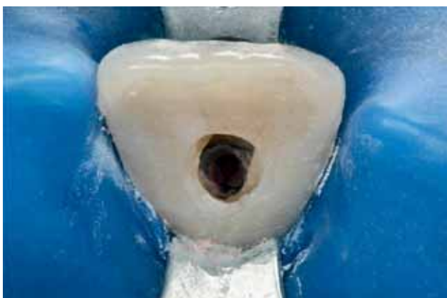
Fig. 5 The access cavity is kept as small as possible. Discolored dentin is not removed. Same case as in Fig. 1.